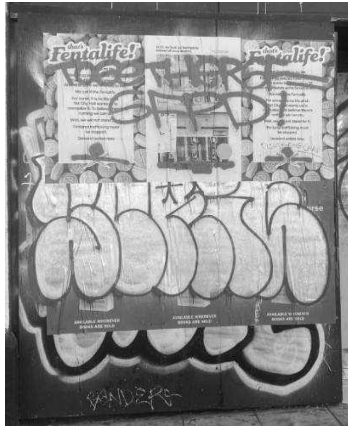
Graffiti reads, “TogetherSF = SFPD!” TogetherSF is a publication owned by tech billionaire Michael Moritz.

We painted messages such as “Narcans Saves Lives, Cops Kill People,” “The War On Drugs Failed,” “TogetherSF = SFPD,” “Cops Sell Fentanyl,” “Fuck You Fascists,” and “Fuck Michael Moritz.”